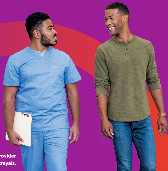
Healthcare provider and patient portrayals.

With EntyvioConnect , you don't have to go it alone.