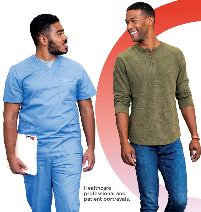
Healthcare professional and patient portrayals.

Please see Important Safety Information on pages 8 , 9 , and 10 .